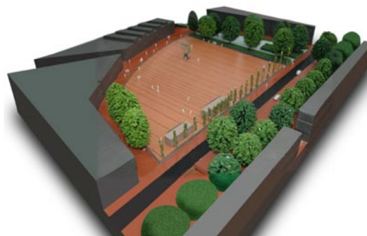
Model of the Market Square

Project: Market Square, Church Square and City Hall Square Client: City of Ede Location: Ede - The Netherlands Area: 2.7 ha. (1.0 / 0.5 / 1.2 ha.) Duration: 2002-2008 Status: Constructed (€ 5.9m.) Partners: OKRA landscape architects, Auke de Vries (artist)