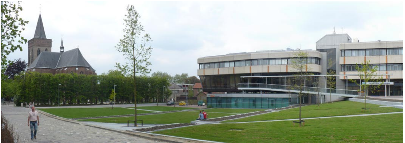
City Hall Square