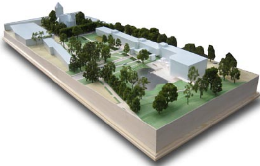
Model of the Church Square (back) and City Hall Square (front)