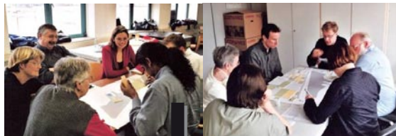
Scenario game on use, surface area and budget

The scenario game with the community, civil servants and politicians played an important part to come to a successful design, celebrated by the neighbourhood.