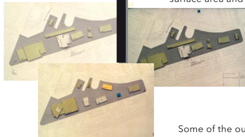
Some of the outcomes