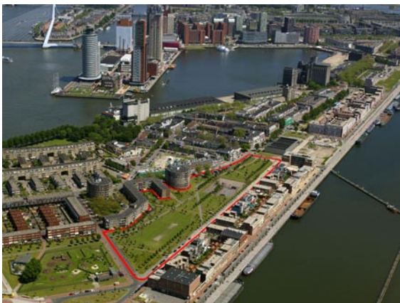
Plan area on the harbour peninsula

Sunken playgrounds are used as ice-skating rink in winter