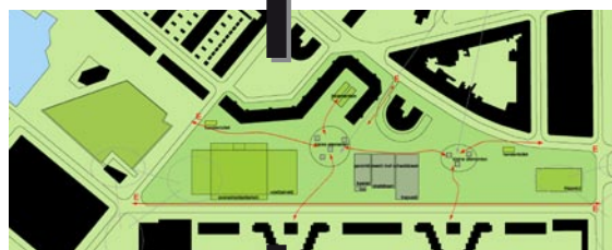
New functional layout