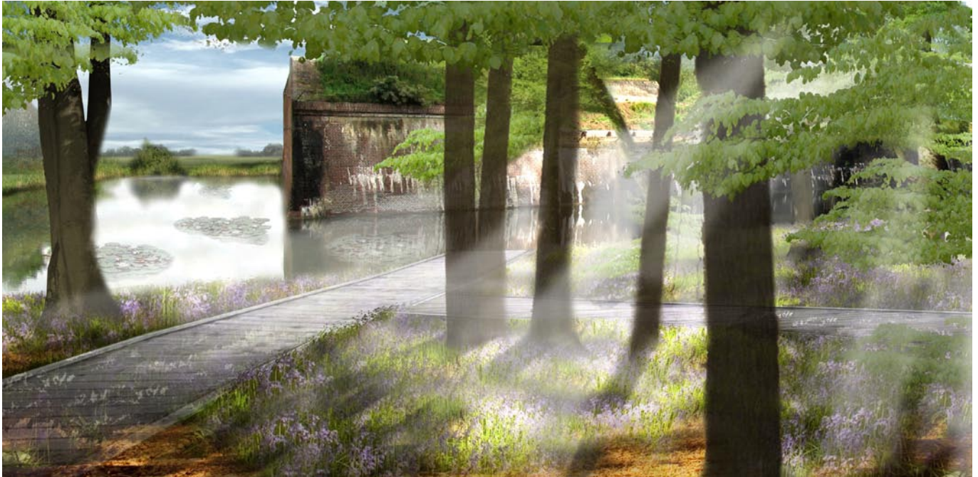
Target image: public path behind one of the lunet-fortresses, connecting the seperated plant-up areas with each other and with the city..