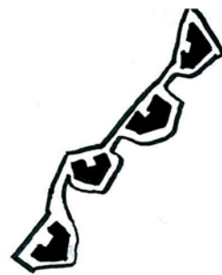
Four lunetten with each it's own history. Each gets it's own character and typical program.